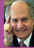
Manuel Elkin Patarroyo Murillo

PLENARY SESSION: 13:00 Salón de Actos Dr. M. E. Patarroyo (→)